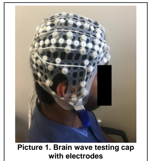
Picture 1. Brain wave testing cap with electrodes